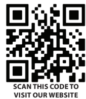
SCAN THIS CODE TO VISIT OUR WEBSITE

1450 Birch Ave | Cottage Grove, 97424 (541) 942-0456 southlanetransit.com